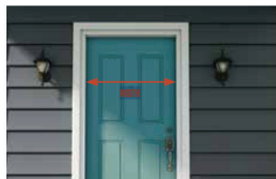
FRONT DOOR/DOOR JAMB