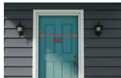
FRONT DOOR/DOOR JAMB